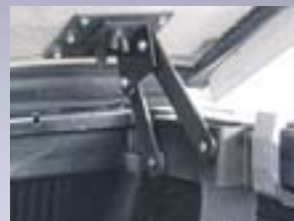
Rage and Hugger front hinge system

For more information visit www.jasoncaps.com