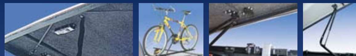
Optional stand alone battery powered interior light Optional bike rack Two stage automotive lock & striker Cantilever assist arms

For more information visit www.jasoncaps.com