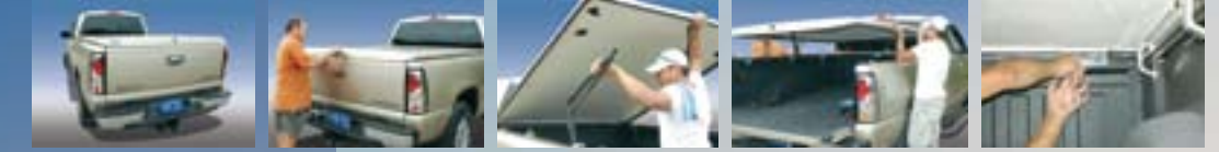
The Dimension is easy to remove

For more information visit www.jasoncaps.com