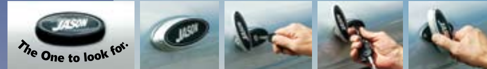
The One to look for.

Jason ION® oval lock standard on Rage and Hugger